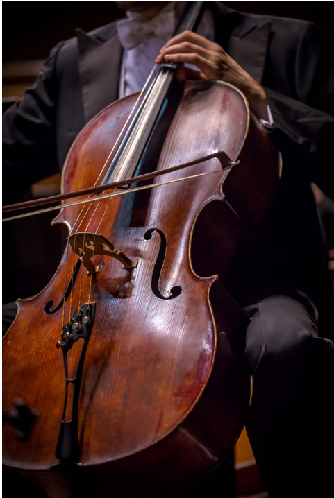
Violinist Augustin Hadelich & Conductor Dima Slobodeniouk

The NZSO is focused on securing funding to support the core areas of our work. We are reliant on the good will of our philanthropic community to strengthen the reach and output of the orchestra.