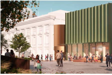
Rendering of Wellington Town Hall, opening Feb 2027