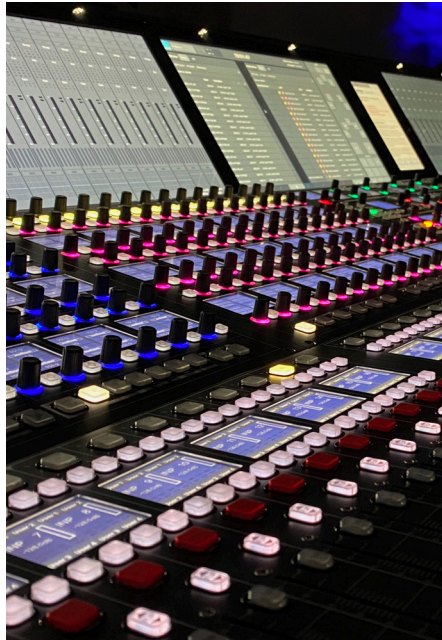
LAWO MC2 96 - Grand Production Console