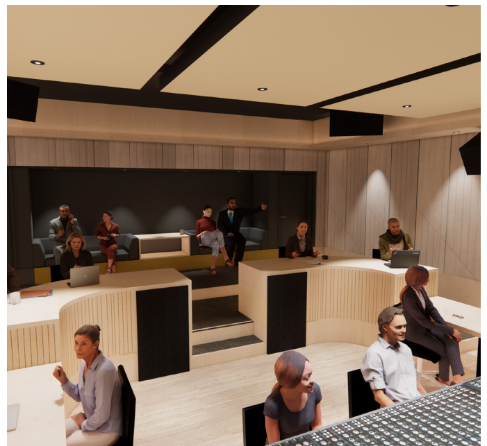
Rendering of NZSO's studio Control Room

NZSO's Studio Technical Overview: LAWO MC2 96 and MC2 56 Grand Production Consoles powered by 2 x UHD Cores providing 768 x 2 DSP channels, ATC 7.1.4 monitoring, 3 x Pro Tools Ultimate on Mac Pros, Integrated control system incorporating comms, vision control, lighting control, signage, Pro Tools timers, and recording status. Microphone stock of 100+ units, including AEA, Beyer, Coles, DPA, Neumann, Rode, Royer, Sanken, Schoeps, Sennheiser and Shure.