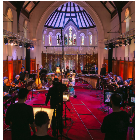
NZSO produced audio and film project at Stella Maris