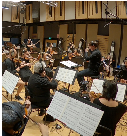
NZSO audio branding project for commercial client at Massey Studios