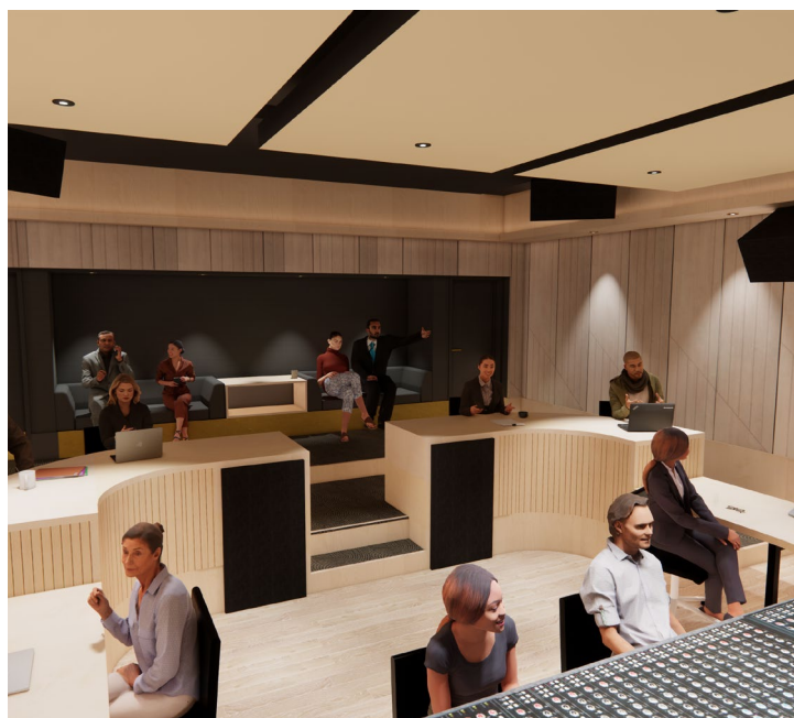
Rendering of Te Ngākau Recording Studios control room