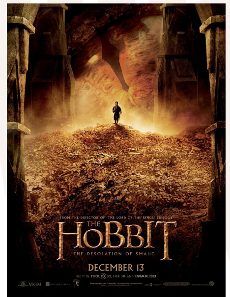
The Hobbit: The Desolation of Smaug , 2013