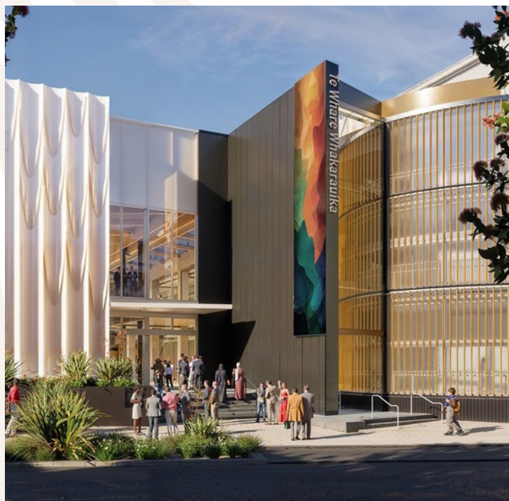
Rendering of Wellington Town Hall, opening Feb 2027

Sitting in the cultural heart of the city, Te Ngākau Recording Studios is an extraordinary new addition to New Zealand's film and music industry. As NZSO's recording home and a commercial destination for artists, ensembles, and production partners, the studios are a space for collaboration and creative solutions, positioning Wellington as a leading destination for orchestral recording.